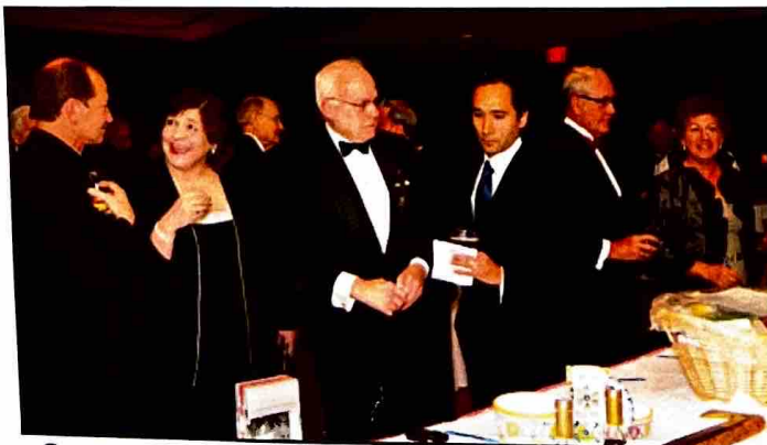
Guests survey the variety of items donated to the silent auction.