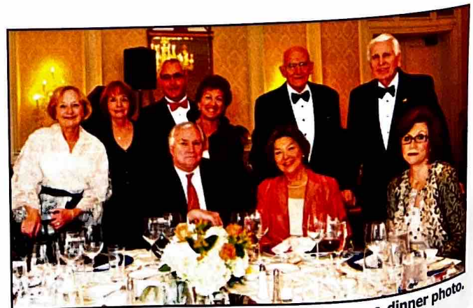
One table gathers for a pre-dinner photo.